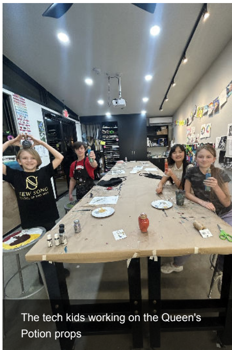
The tech kids working on the Queen's Potion props