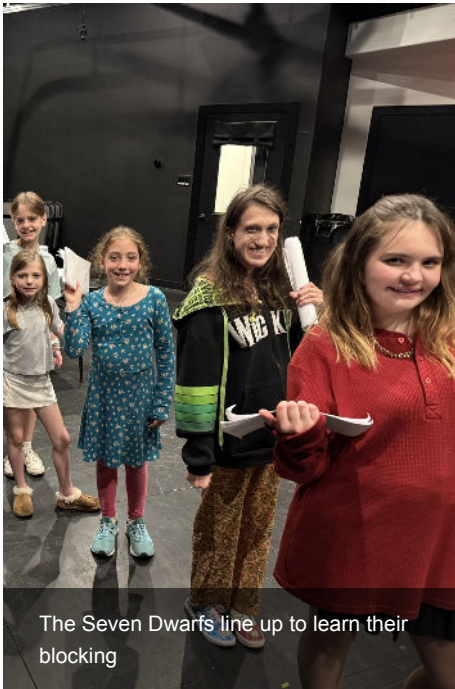
The Seven Dwarfs line up to learn their blocking