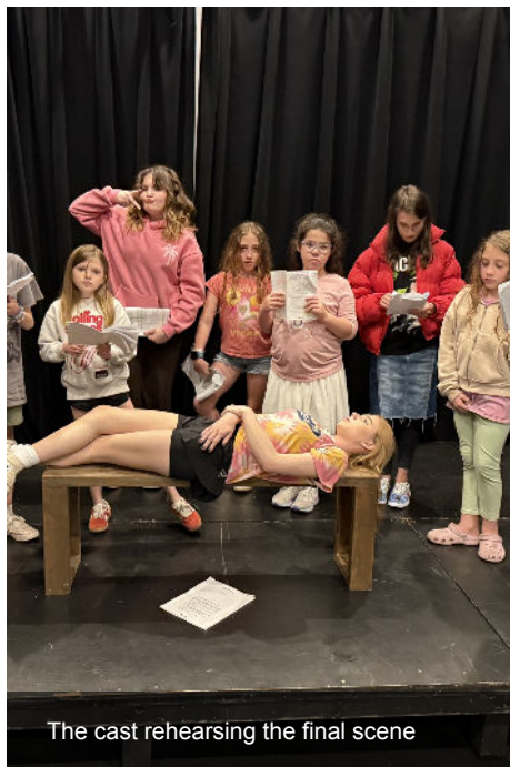
The cast rehearsing the final scene